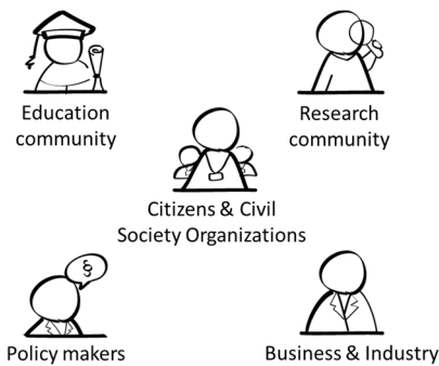
Figure 1. Examples of societal groups targeted by the JoinUs4Health project.

Note: The minimum age to register on the JoinUs4Health platform is 16 years.